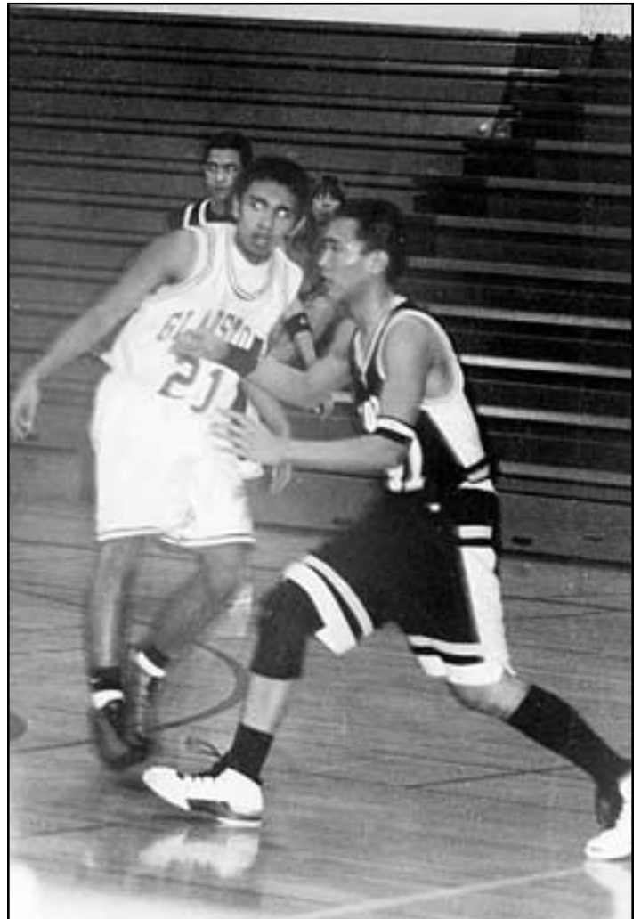
The Vikings are 3-2 in league heading into tonight's big game against the Covina Colts

Putting the losses behind and only looking ahead, the boys are up for a challenge when they play Baldwin Park. After that they start over and look to dominate those who beat them.